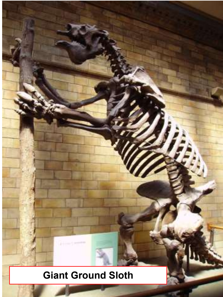
Giant Ground Sloth